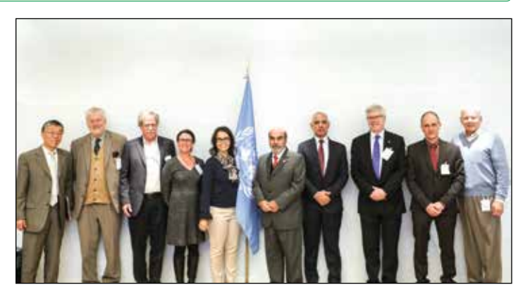
AIRCA Steering Committee meets with DG, FAO

Agricultural diversification will expand the current food systems through increasing species diversity and more resilient