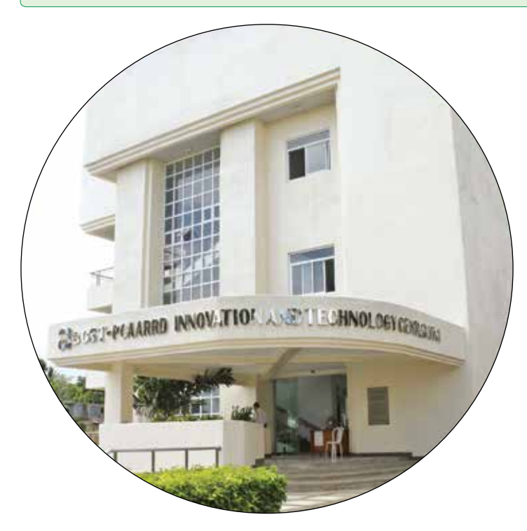
The DOST-PCAARRD Innovation and Technology Center (DPITC) is envisioned to serve as a one-stop hub for the facilitation of technology commercialization

According to Dr Carlos, deployment and extension are resorted to when effective technology utilization and adoption are influenced by non-market considerations. On the other hand, commercialization is optimized for technologies that can reach users and adopters more efficiently through the market system.