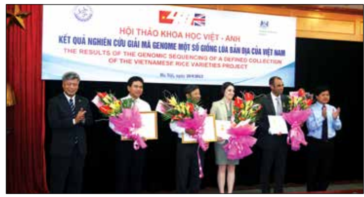
Deputy Minister of Vietnam MARD awarded AGI and Earlham Institutes certificates of outstanding research on rice genome sequencing

In Vietnam, rice is a principal crop of economic importance. However, rice growing areas and rice productivity are being significantly reduced due to increasing adverse effects from climate change. To address this concern, in 2012 Vietnam's Ministry of Agriculture and Rural Development (MARD), Ministry of Science and Technology (MOST), Agricultural Genetics Institute (AGI) and the Genome Analysis Center (TGAC), Earlham Institute, the John Innes Centre (JIC) in the United Kingdom (UK) launched a collaborative research project.