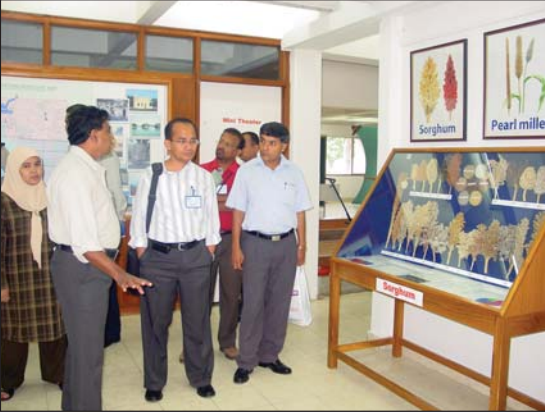
Participants visiting ICRISAT facilities