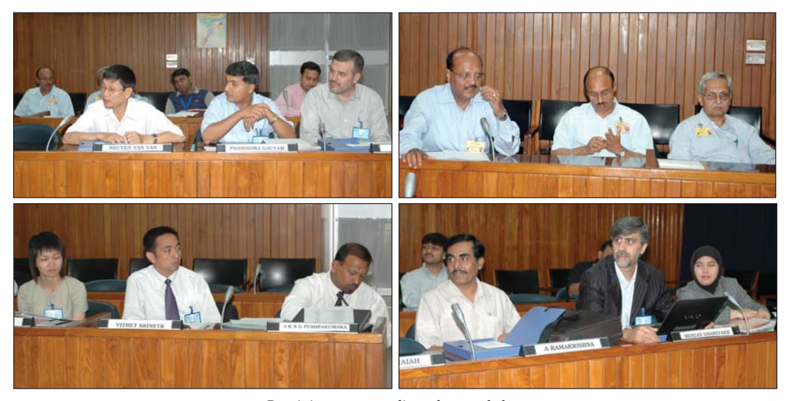
Participants attending the workshop

All the countries emphasized the need for capacity building in areas of risk assessment and management, and detection procedures and protocols for transgene