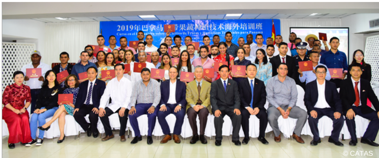
CATAS Training Course on Planting Technology of Tropical Fruit and Vegetable in Panama

CATAS has held 7 international training courses on tropical agriculture technology for 382 participants and 40 domestic training courses for 4000 Chinese farmers in the fields of tropical cash crops, tropical food crops, winter melon and vegetables, tropical forage and animal husbandry.