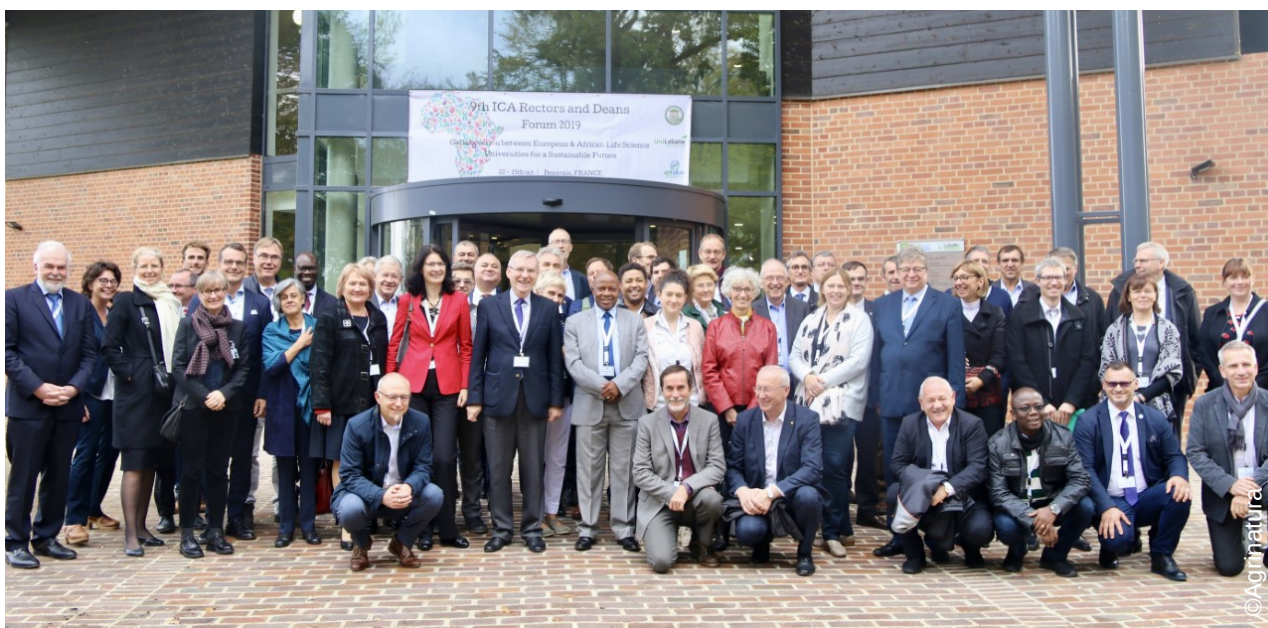
Group picture during the 9th ICA Rectors and Deans Forum held at UnilaSalle – Campus de Beauvais, Beauvais (France) in October 2019.

“Collaboration between European and African Agricultural and Life Science Universities for a Sustainable Future” was the topic of the 9th annual ICA Rectors and Deans Forum held in October 2019. The Forum looked ahead to 2030 and explored opportunities for collaboration between European and African agricultural and life science universities to strengthen their engagement for mutual gain, and to address the challenges of developing a sustainable future against the backdrop of the UN Sustainable Development Goals. The Forum was attended by leaders who are responsible for strategic decision making in universities and faculties of Agricultural and Life Sciences (Rectors, Deans, senior management) and comprised 58 participants from 23 European and 6 African countries.