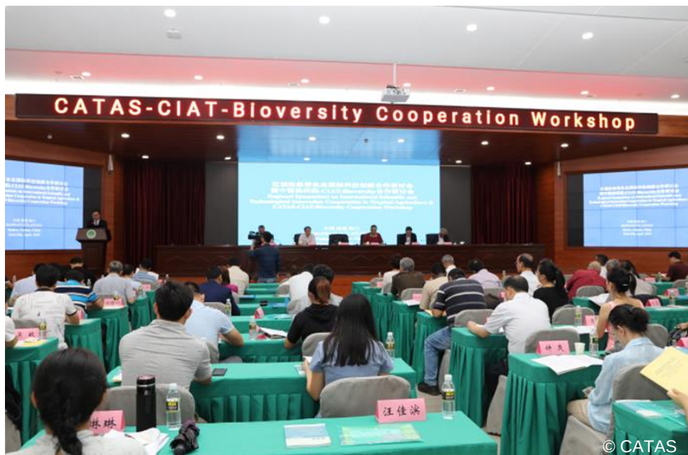
CATAS-CIAT-Bioversity Cooperation Workshop held in 2019 at CATAS.

CATAS, CIAT and Bioversity organized a Workshop & International Scientific and Technological Innovation Cooperation Seminar on Regional Tropical Agriculture which was held at CATAS for discussing cooperation themes and key projects of China-Asia Pacific countries and international organizations in the fields of tropical agricultural science and technology innovation cooperation, joint R&D platform construction, international technology transfer and personnel exchanges and visits.