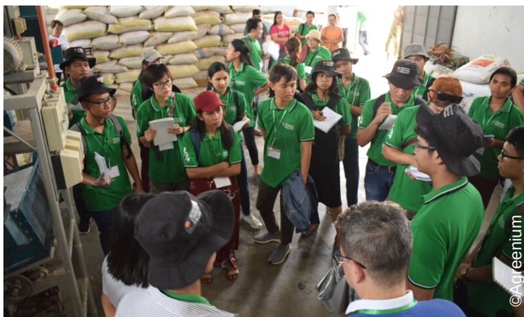
Students of the summer school during the visit of a rice cooperative in the Camarines Sur region in the Philippines

More than 40 participants from 17 European countries and Southeast Asia gathered at the University of the Philippines Los Baños (UPLB) during the first week and then at Camarine Sur (southern Luzon Island) for a second week of a diagnostic exercise. During the closing ceremony, the students presented the results of their study to the partners they met during the diagnosis: farmers, processors, cooperatives, local authorities.