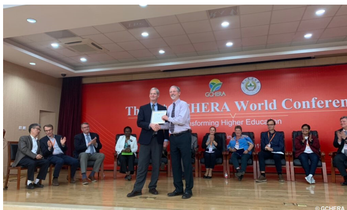
10th GCHERA World Conference in Nanjing, China, October 2019

Successful innovations in the area of education were shared, demonstrating commitment to responding to the need for educating our future leaders with the skills, knowledge and capacities to respond to the challenges of the 21st century including a more sustainable agriculture, climate change, entrepreneurship, job creation and rural development with a more ethical, value-based decision making.