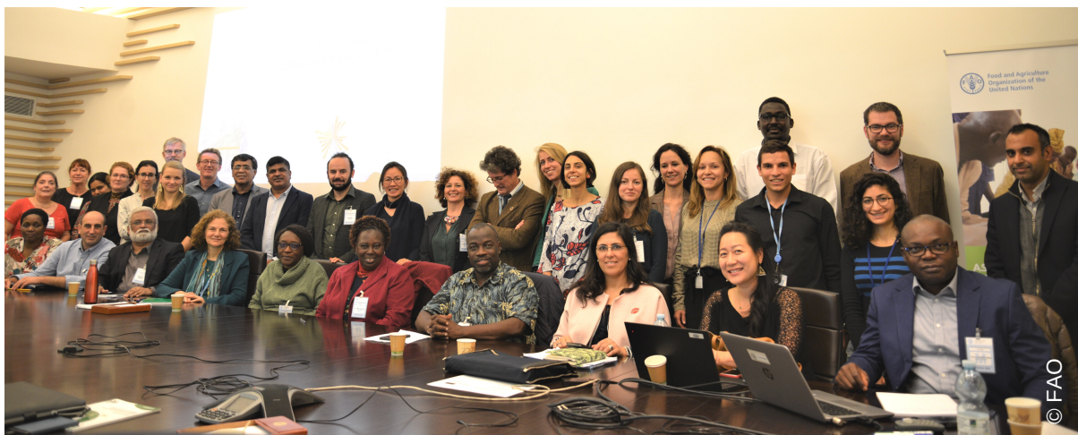
Group picture taken during the FAO Workshop on Assessment Metrics for Agricultural Innovation Systems and Extension and Advisory Services, held at FAO (Rome) in November 2019.

Without adequate assessment and measurement of the properties and performance of an AIS and its sub-systems, such as the agricultural extension and advisory services (EAS), it is difficult for policymakers and practitioners to design approaches, promote policies and investments that foster greater innovation in agriculture. To that end, FAO Research and Extension unit is finalizing guidelines that help assess the AIS at national level and a guide of assessing the EAS at system level in the countries and is completing this work with a robust set of indicators and metrics to provide stronger evidence on the status of AIS and EAS to decision-makers and investors, to track the progress, measure the performance, and inform on their investment.