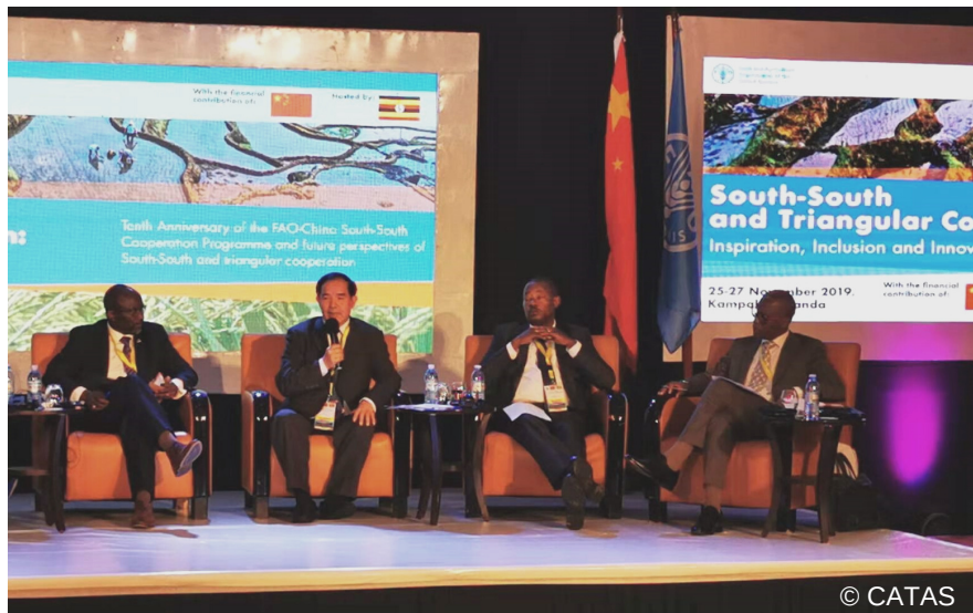
FAO-China South-South Cooperation event held in November 2019 in Uganda