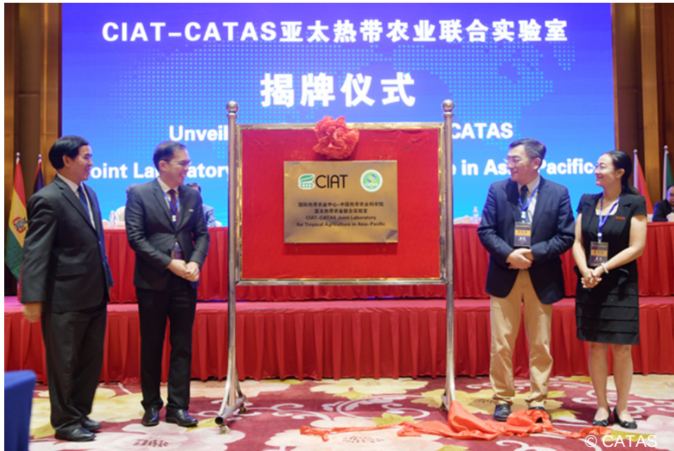
CATAS-CIAT Joint Laboratory for Tropical Agriculture in Asia-Pacific was established in September 2019 in Haikou (China).