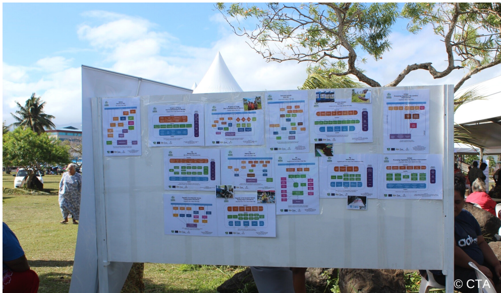
The value chain and stakeholder maps were exhibited during the agricultural show of the 2nd Pacific Week of Agriculture, October 2019 in Samoa

By facilitating opportunities for interactive knowledge-based training as well as blended-learning through technical backstopping; both on- and offline at individual and organisational level, and supporting the creation of the enabling policy and institutional environment, the Innov4AgPacific project is contributing to developing capacity for strengthening agricultural innovation systems in Pacific Island States. An updated OPPO training manual ( https://innov4agpacific.pipso.org.fj/wp-content/uploads/2019/12/Draft-Pacific-OPPO-Manual.pdf ) comprising all tools is being finalised and will be published early 2020 and made available on the Innov4AgPacific website.